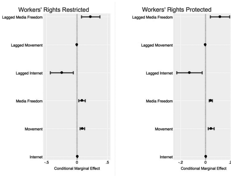
FIGURE 2 Conditional Marginal Effects of Spatial and Nonspatial Hypothesized Variables from Ordered Logit

media freedom and labor rights but also suggest that a spatial connectivity exists between the two variables.